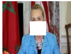
Clinton: Anti-Islam Video 'Disgusting'