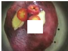
Disgusting or Delicious: Placenta Recipes