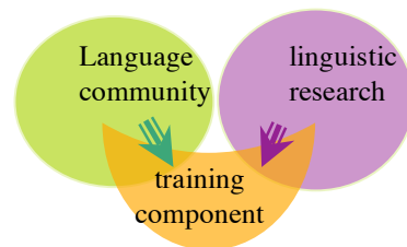
Figure 2: Beginning rebalancing

In order to reinstate agency back to the community, it is necessary to change the value that created the imbalance to begin with. If that value was that the linguist was an outsider, changing its value means that the linguist will need to be an insider, that is, a member of the community. One way to accomplish this is by training, that is, by transferring to the community the knowledge that makes us linguists knowledgeable: