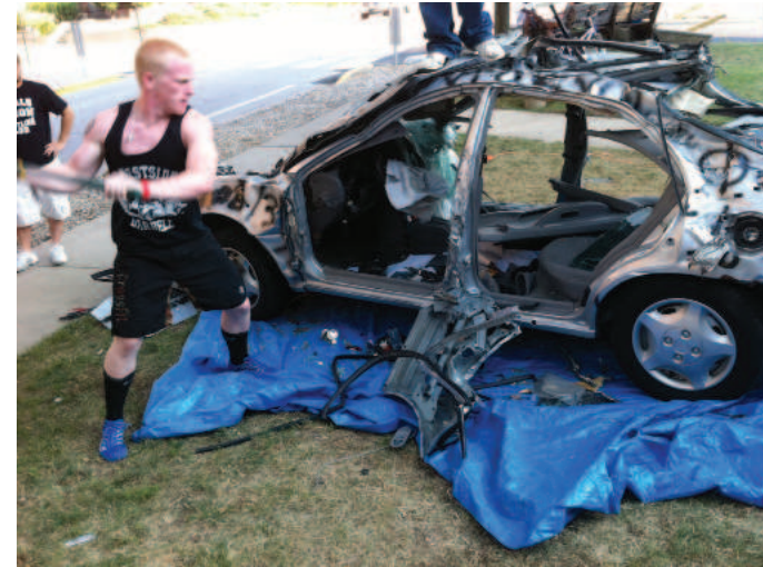
Rush event: "Car Smash"