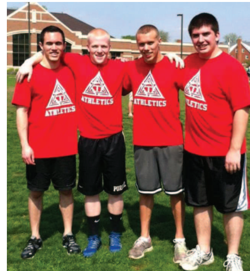
Brothers participating in a Greek philanthropy, "Patriot Games."

Ask us about the upcoming Fall 2012 Rush season!