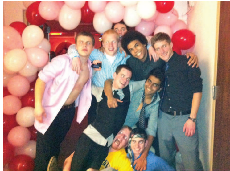
Brothers taking a picture at Crush Dance.