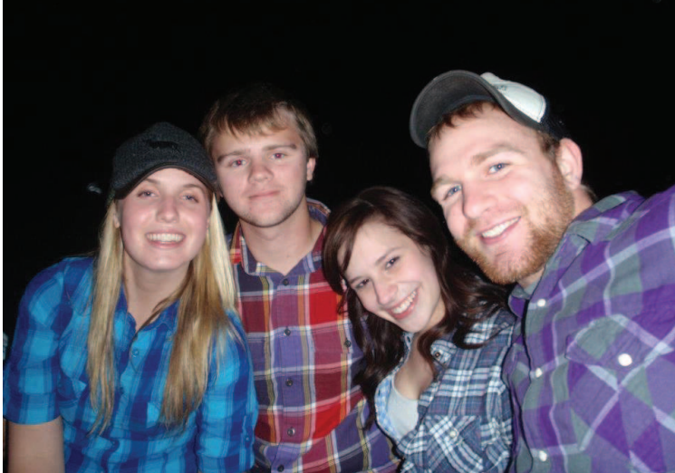
Brothers and their dates at a Barn Dance.