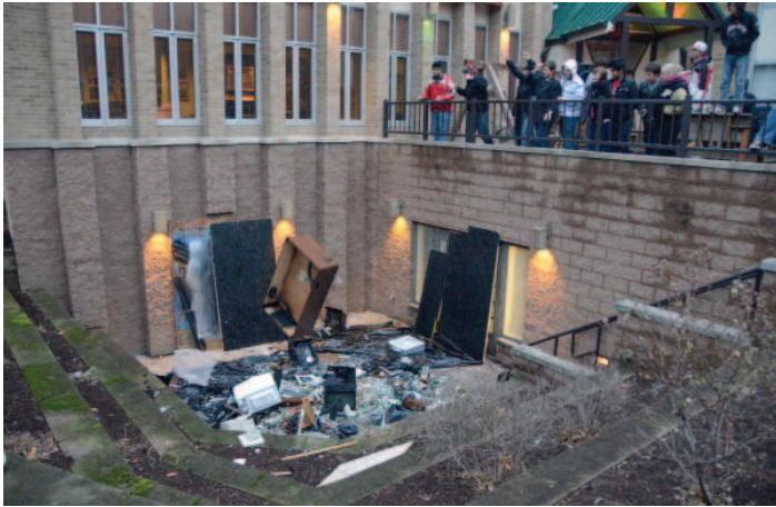
Rush event: "Break or Bounce"