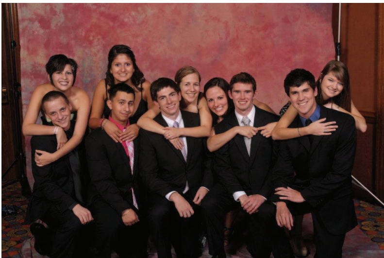
Brothers and their dates at formal.