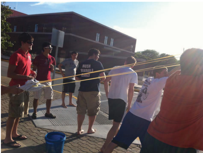
Rush event: "Water Balloon Launch"