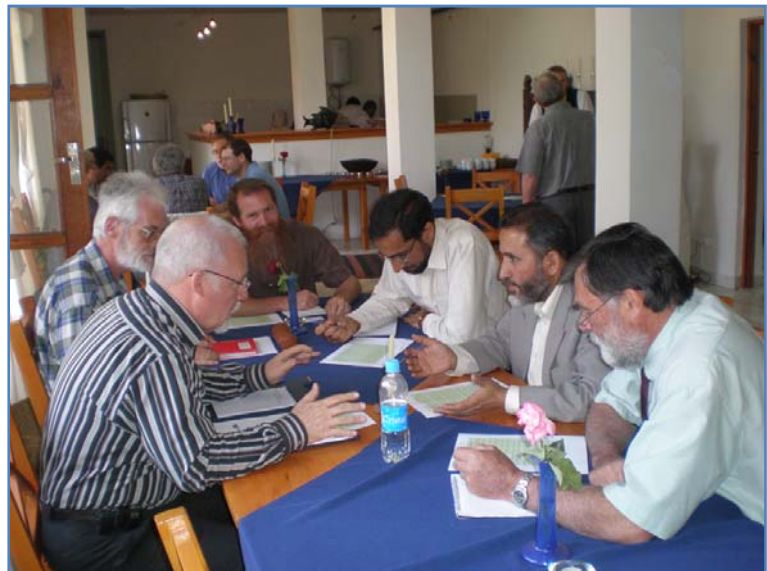
Figure 1: Participants discuss the constraints and priorities facing the livestock sector