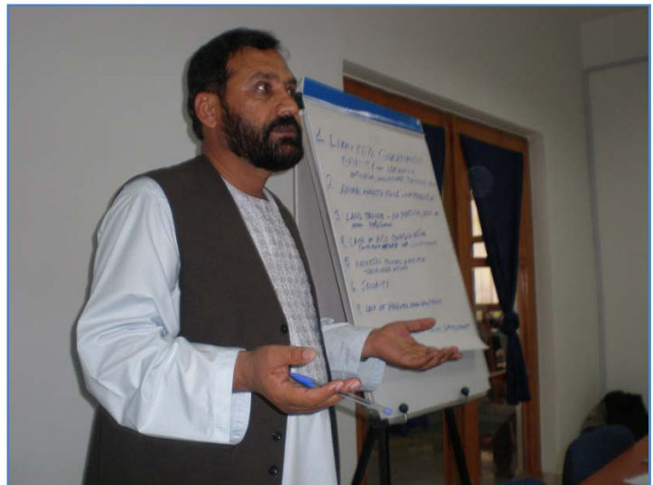
Figure 2: A participant presents the results of his group's discussion.

Based on the list of twenty-five constraints and priorities facing the livestock sector, workshop participants broke into new groups to refine and narrow its contents by selecting a handful of items that represented the greatest constraints on the sector's growth yet still remained under the control of implementing agencies. The aim was to reflect on an operating environment where resources are scarce and attention is often divided and identify a handful of critical priorities that merited the greatest effort and attention.