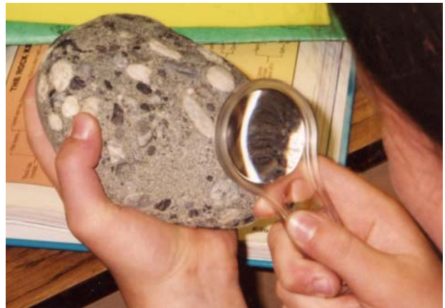
.Figure 5. Students making observations of rock samples.