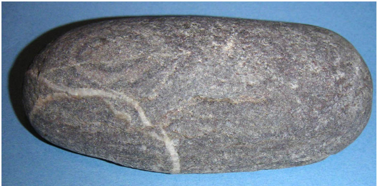
Photo of rock sample (optional; for comparison with sketch in sample).

3. Rock type or classification (igneous, sedimentary or metamorphic; include evidence, rationale and observations which justify your classification) and rock name (if possible; such as granite, basalt, sandstone, limestone, gneiss, etc.):