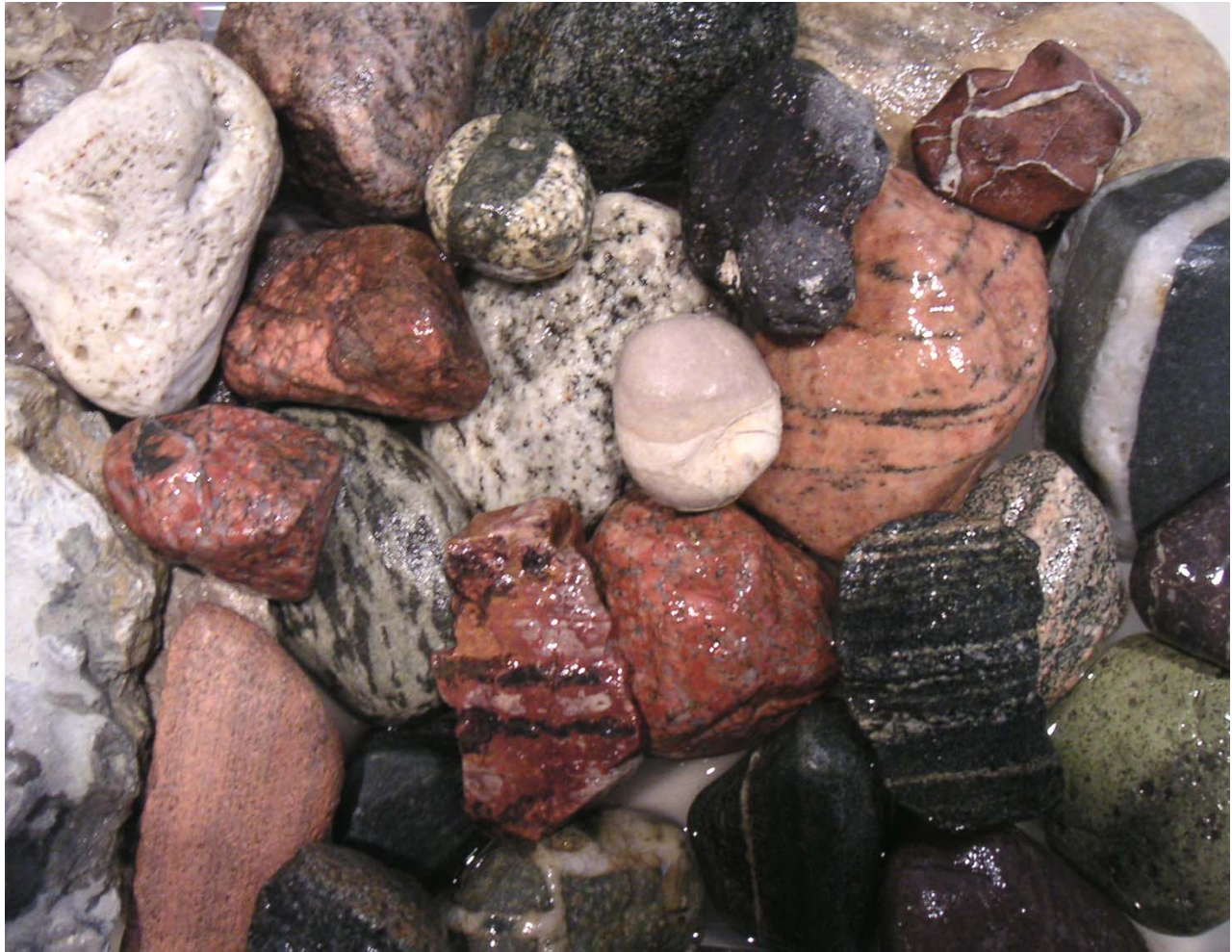
Figure 2. Pebbles selected for the Every Pebble Tells a Story activity.