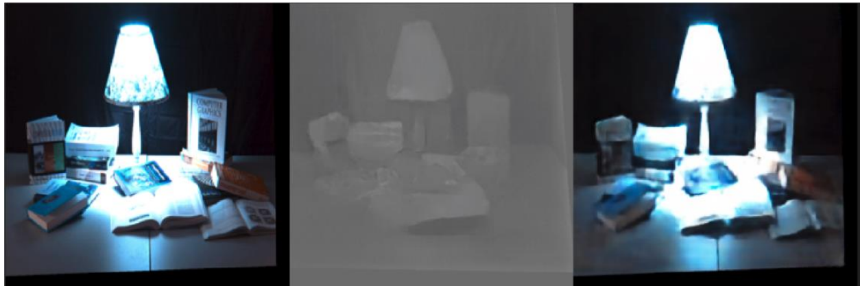
RGB image (input)